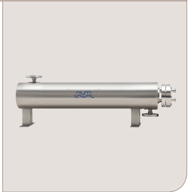
Fig. 1. Double tube sheets prevent cross contamination between the product and the heating/cooling medium.